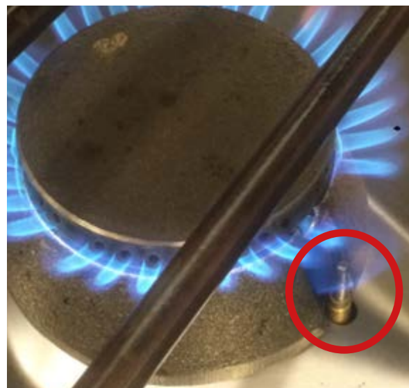
Flame Failure Device

6. Appliances must be correctly set up and connected to cylinders. They must be properly maintained and subject to annual servicing and checks by a Gas Safe